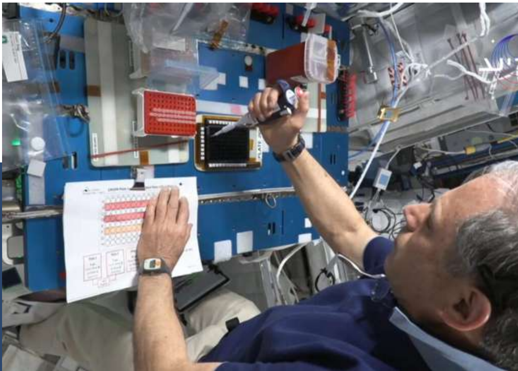
Eytan Stribbe on the International Space Station